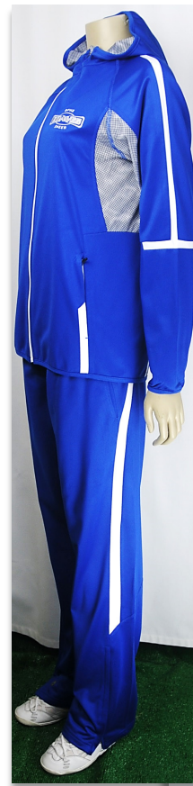
D. Fortitude Jacket #229151 $50.00

Agil-Knit brushed poly, infrared dot print along heat zones for breathability, inside pockets, raglan sleeves, Spandex bound hood, cuffs & hem. Youth S-XL/Ladies S-XL/Unisex S-3XL. See color options.