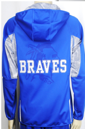
Full Back Reverse Laser Applique & Laser Etch